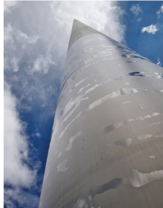
The Dublin Spire – a stunning example of our surface texturing technique showing the versatility of controlled shot peening

Tailoring our services to meet your needs